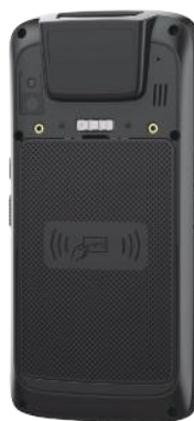
EM-T52 Rugged Handheld